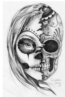
Half and Half drawing