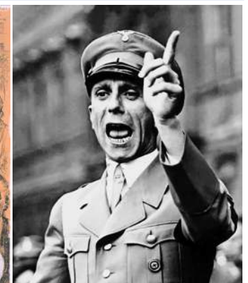
Joseph Goebbels: Minister for propaganda